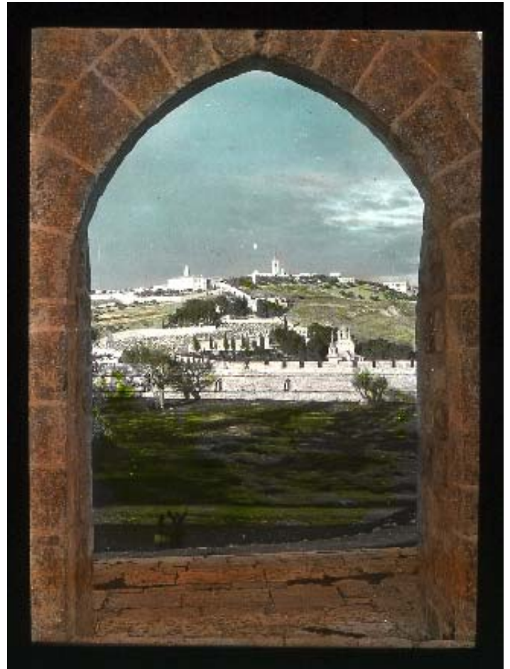
A hand-colored lantern slide, The Mount of Olives from the Jerusalem wall, is a photograph made by the American Colony Photographers.