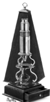
Culpepper Microscope by »Beuler, London«, c. 1780