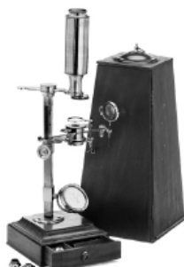
Microscope »Jones, London«, c. 1800