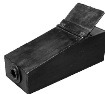
Wooden Reflex »Camera Obscura«, c. 1830 With 5 x 6 in. ground glass screen. Focusing lens in card barrel – very early!