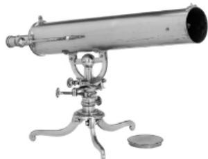
Reflecting Telescope by »J. Bird, London«, c. 1830