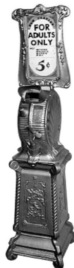
Cast-Iron »Clamshell Mutoscope«, c. 1900 In excellent working condition, with original movie reel.