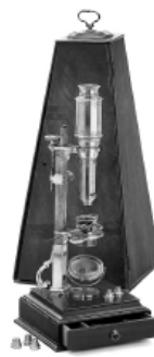
Cuff-type Microscope, c. 1780