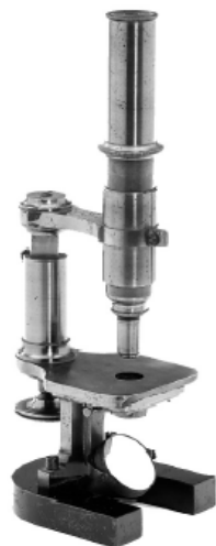
Microscope by »C. Kellner's Nachf. E. Leitz in Wetzlar«, 1860 Extremely rare pre-Leitz microscope!