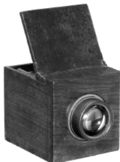
Sensational Find: Probably the last camera by Nicéphore Niépce, c. 1830-33 with original lens by Vincent Chevalier. We invite all serious experts worldwide for personal inspection!

Giant collection of approx. 300 important camera lenses of all sizes from early Chevalier, Lerebours, Secretan, Hermagis, Darlot, Jamin, Derogys, Dallmeyer, Voigtländer to contemporary Leica + Nikon lenses.