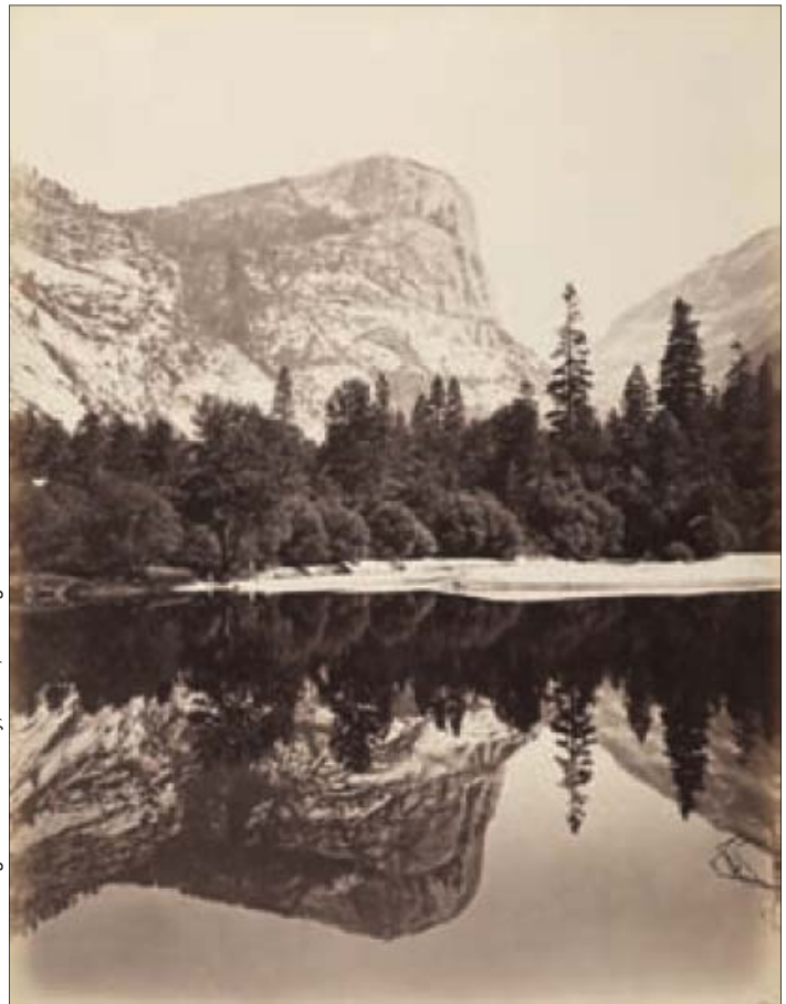
Charles E. Young Research Library, UCLA, Los Angeles

snap shots , is published by the Photographic Historical Society of New England, Inc., P.O. Box 650189, West Newton, MA 02465-0189.