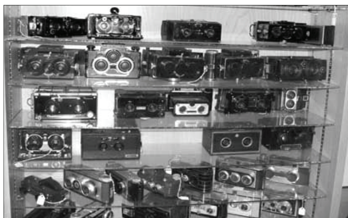
A gaggle of mostly stereo cameras.