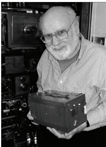
Krugener Cinquantés Plaques or Simplex Folien detective camera, circa 1892. A wishful competitor of The Kodak, it used a magazine of gelatin dry film pasted on paper. Anything but simple, it had Rube Goldberg complexity and was a commercial disaster.