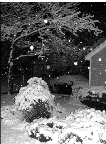
Storm Watch, Saturday night, Jan. 3

When the weather is questionable, anyone who expects to attend the meeting should check for updates on the PHSNE website phsne.org . If you are still in doubt about the status of a meeting, phone or e-mail any Board member. Contact information is contained in your PHSNE Membership Directory. We will also try to get cancellation notices on WBZ radio and television but cannot be certain these announcements will be made in a timely manner.