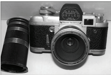
Alpa 6 B—to be sold at auction

It's auction time again. Add that special piece to your collection, buy accessories to upgrade your camera, pick up a "treasure" from the dollar table, sell on consignment the items