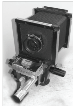
Sinar, 4x5 studio camera

til 12:30 P.M. Members can bring up to 6 items or 6 lots, or any combination. The auction starts promptly at 1:00 P.M. PHSNE items alternate in groups with consignment items. A variety of collectible cameras and images are for sale as well as photographic equipment, accessories, books about photography, and other items of interest to collectors (see PHSNE website for list of items).