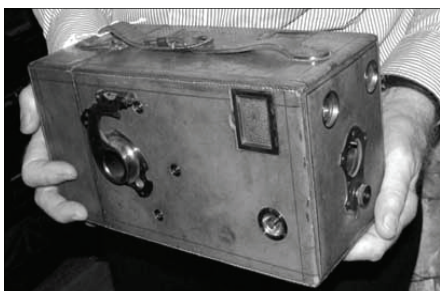
The massive Ernemann 6 x 9 Ermanox with huge 12.5 cm. f.1.8 Ernestar (nearly 4 pounds!) Salomans' was half the weight).

Boats and cameras may seem a strange mix, but one collector's interest in restoring wooden cameras was "driven primarily by modest boat-building skills and the sensual pleasures of the sight and touch of wood and brass." These pleasures are evident in the many classic wood and brass cameras on display in his home. When necessary, he is able to research and duplicate wooden camera parts.