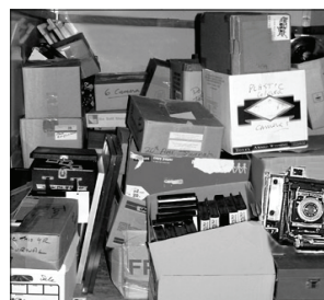
Truck loaded and ready to go

In the event of bad weather, the snow date for the auction is February 14th. Check phsne.org if there is a question about the weather. For additional information about the auction, go to phsne.org or phsne.org/forum .