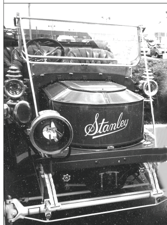
Stanley's other invention!

Twin brothers Freelan and Francis Stanley, best known for the invention of the Stanley Steamer,