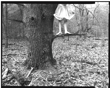
Agnieszka Sosnowska, Norwell, Massachusetts, 2003

On First Contact is not a sci-fi themed exhibition, but rather an exhibition of film-based contact prints and contact sheets. Panopticon Gallery will be hosting this exhibition through January 14, 2014 which