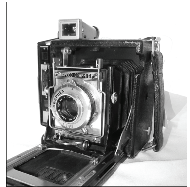
Speed Graphic, Auction item:

I continue to be amazed at the diversity of the images and equipment as well as the quality of the materials that shows up at every Photographica . I thank the members and the public who attend Photographica loyally and the support that they give to the show dealers over the years. Photographica and shows like it will continue on only as long it is deemed a value by both parties.