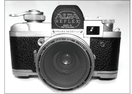
ALPA REFLEX VI b

PHSNE members working at the warehouse in preparation for the upcoming auction came across a camera several of them had never seen before. The camera is the ALPA REFLEX