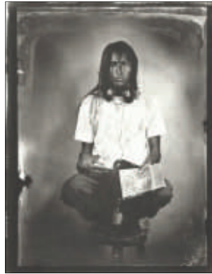
Will Wilson image

The platinum printing process was invented in the 1870s, and platinum prints were immediately praised for their unprecedented tonal range, as well as being stable, permanent, and indelible. By the end of the 19th century, art photographers used the platinum process to present a romantic vision of Native peoples—then understood to be a “vanishing race”—as they struggled against disease, poverty, assimilationist policies, and dispossession of tribal lands.