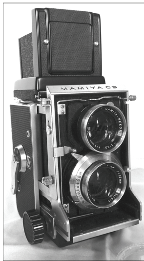
Mamiya C3, Auction item