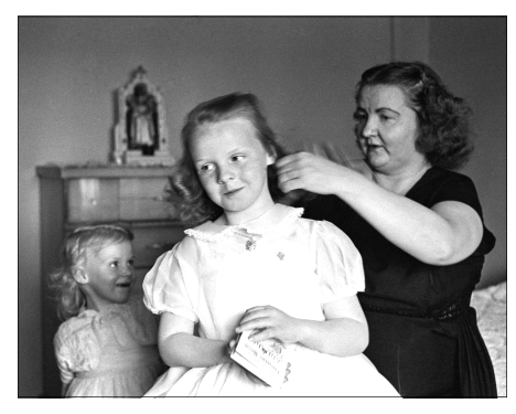
First Communion, Bronx, NY, 1961, from the series Making Out 1957-80

Larry Fink: Primal Empathy will be on display at deCordova Sculpture Park and Museum in Lincoln. MA from October 19, 2018 through March 10, 2019.