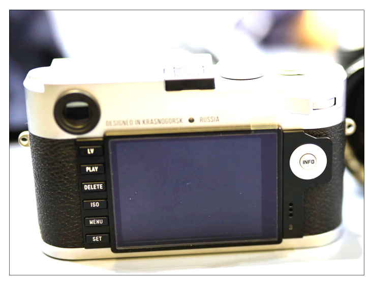
Zenit M Digital Camera, photo by Chris Gampat

"The Zenit M is technically based on the Leica M Type 240 platform, but was modified both in terms of hardware and software. . . The lens creates an image that doesn't require processing (and) has unique bokeh and soft focus effect. The design of Zenit M copies designs of the legendary Zenit and Zorky