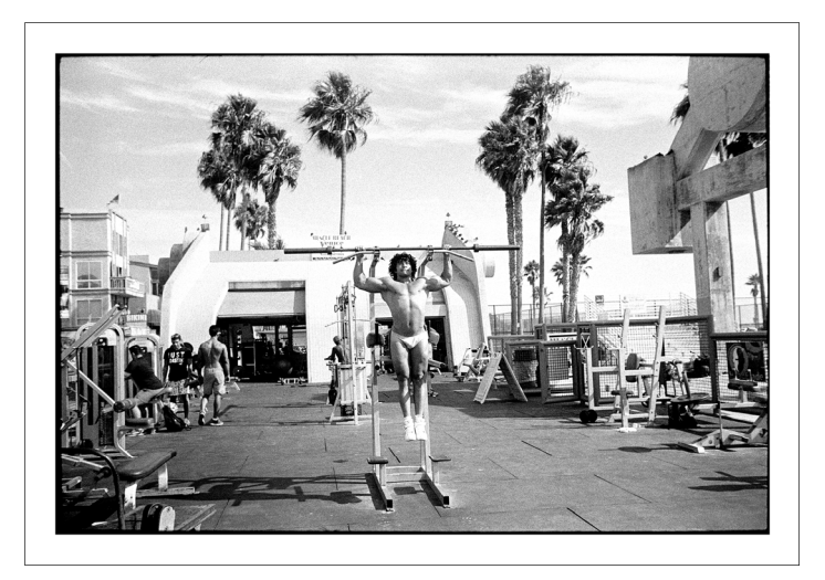
Venice Beach, Venice, California