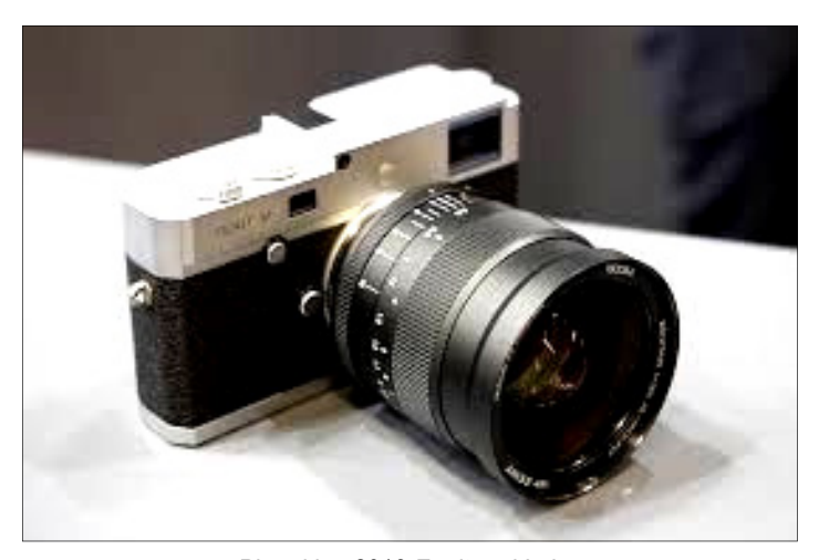
Photokina 2018 Zenit and Leica

Russian camera manufacturer Zenit and German manuracturer Leica have teamed up to produce the Zenit M, a new digital rangefinder camera. The camera was unveiled at Photokina 2018 , "the largest international trade fair for the photographic and imaging industries" which was held in Cologne, Germany (September 26, 2018 press release at <a href="https://markets.businessinsider.com/news/stocks/zenit-and-leica-present-joint-production-camera-1027565675">https://markets.businessinsider.com/news/stocks/zenit-and-leica-present-joint-production-camera-1027565675</a>).