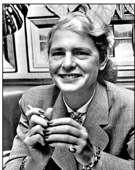
Margaret Bourke-White, 1955

In the October 2019 snap shots , PHSNE invited members to submit nominating forms to induct photographer Margaret Bourke-White into the New Jersey Hall of Fame in the Arts and Letters category. We are pleased to announce that this, in fact, has come to pass: Ms Bourke-White was among the 2022 inductees.