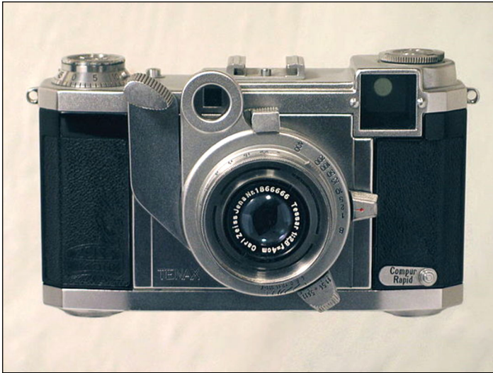
Tenax II

The Tenax name dates back to 1907. It appeared on folding plate cameras manufactured by the C. P. Goerz company in Berlin. It's easy to be confused by the chronology of the Tenax cameras since “the advanced 1938 model is known as mark II, or just Tenax II, while the simpler [but later] 1939 model is known as Tenax I” ( http://camera-wiki.org/wiki/Tenax_II ). The history of the Tenax name and production is complicated due to trademark disputes, company mergers, and timing (WW II).