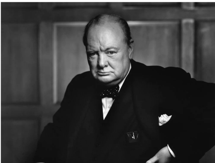
Roaring Lion, Yousuf Karsh

In August, the Fairmont Chateau Laurier, a Canadian hotel, realized that its iconic Yousuf Karsh photo of Winston Churchill had been stolen and replaced with a fake.