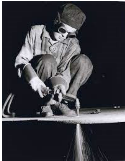
Margaret Bourke-White Flame Burner Ann Zarik artmuseum.princeton.edu

A major ticketed exhibit opened on October 9th at the Museum of Fine Arts in Boston. It is scheduled to run until January 16, 2023.