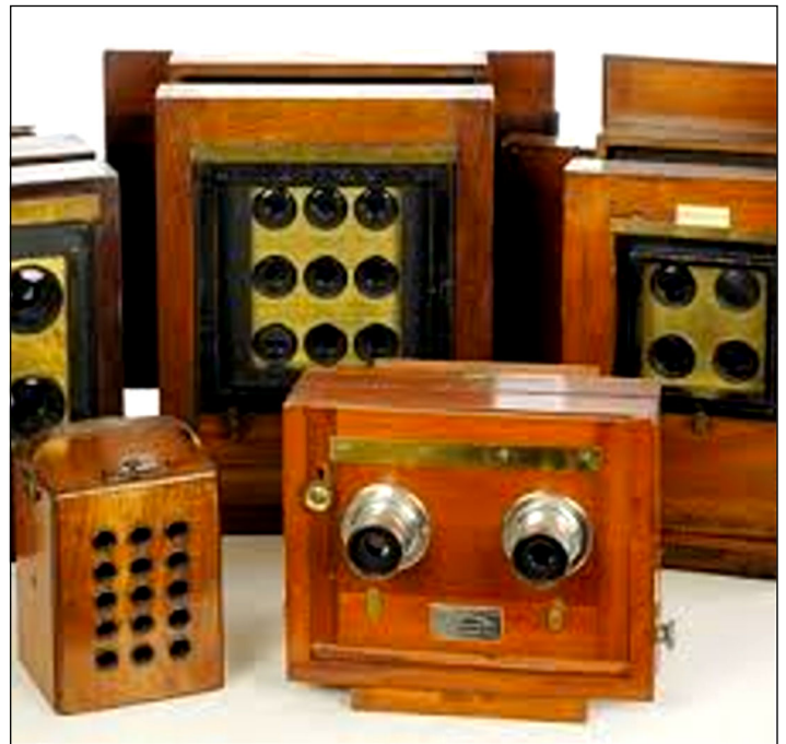
Gem tintype cameras