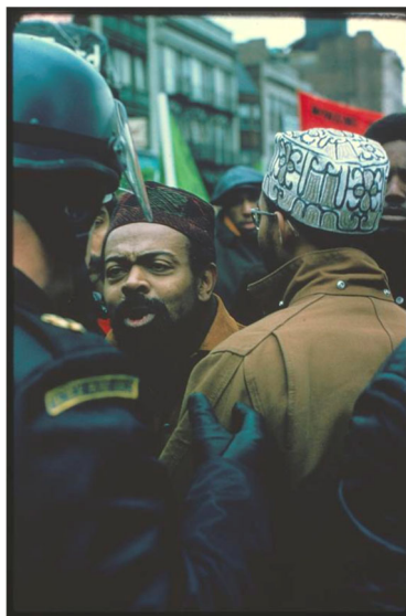
Amiri Baraka (nee LeRoy Jones) at Boston protest