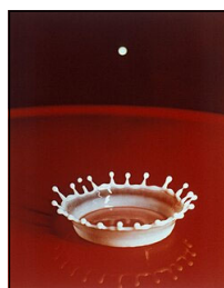
Wikimedia Commons Public Domain

Long a familiar and beloved figure on campus, one-time PHSNE member "Doc" Harold Edgerton taught at MIT for decades. The stroboscopic cameras he developed could register almost-infinitesimal gradations of motion, and he produced "some of the most famous images in photographic history: a splashing drop of milk turned into a coronet at the moment of impact, a bullet exiting an apple, the indentation of a football as a kicker's foot strikes it" ( https://www.bostonglobe.com/2026/02/10/arts/freezing-time-strobe-photos-mit-harold-edgerton/ ).