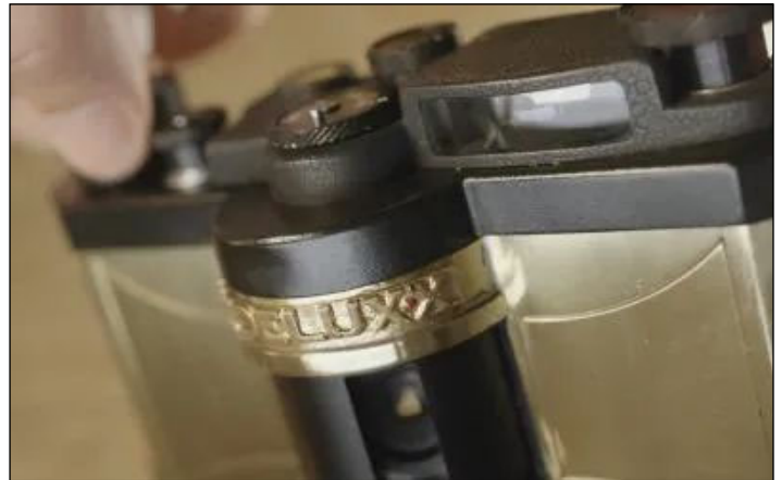
Prototype WideluxX, 2025

The prototype was revealed recently, in late 2025. While little is known about the new model, it is expected to be based on the F8 model and to be manufactured in German factories that rely on green energy. “Staying true to its analog roots, the WideluxX will be purely mechanical, preserving everything that made the original great while incorporating sustainable manufacturing practices.” The new model, however, is designed to be “less temperamental” than the F8.