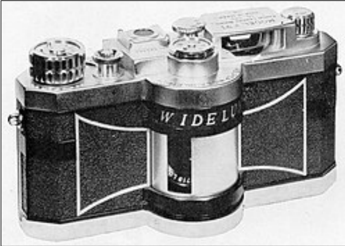
Widelux F6, 1969

The Widelux camera, introduced in Japan by Panon Camera Shoko in 1958, is a fully mechanical swing-lens panorama camera that comes in 35mm and medium format models. The lens pivots on a horizontal arc, and a slit exposes the film; the camera has no shutter. The pivoting motion causes some distortions