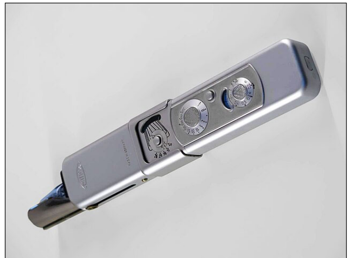
Minox B, top, Unknown Author, Wikimedia Commons Creative Commons Attribution

There is one last thing to note. On the model B, opening the camera always advances the film. If you do not take a picture after opening the camera, and just close the camera, you create a blank shot. This was corrected in later models. The camera does need