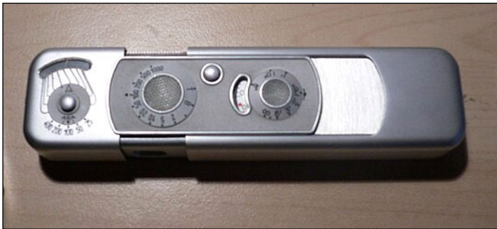
Minox B-3

This month we'll be looking at a subminiature Minox camera, specifically the model B, made from 1958 to 1971. It is a classic spy camera because it is tiny (3.8" x 1.1" x 0.6") and easily concealed. Subminiature refers to the tiny negative size – 8x11mm on 9.5mm film. The film comes in a tiny (46 x 19 x 10mm) cartridge that originally held between 15 and 50 exposures. The B's exposure counter goes up to 50, but newer models' counters only go to 36. Film is still made for these cameras in 36 exposure cartridges.